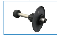
New media feed flange