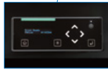
LED touch panel