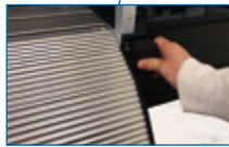
Multi-stage pressurizing mechanism