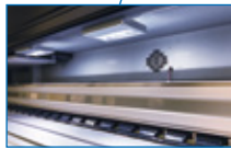
Internal LED lighting