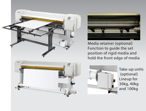
Media retainer (optional) Function to guide the set position of rigid media and hold the front edge of media

Adopted rubber rollers increase the versatility to the rigid media. The automatic media thickness measurement and print head height adjustment allows you to print at the optimal height up to 15mm. The media retainer is available as an option to guide the set position of rigid media and hold the front edge of media. Besides, optional take-up units make printing on roll media comfortably.