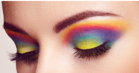
MUTOH Clear tone achieves more beautiful image with smooth and less variation in skin color density.

VerteLith™ is an advanced RIP software with various functions, equipped with "MUTOH Clear Tone", an original half-tone technology that optimizes the performance of the MUTOH printers and delivers beautiful image quality with smoothness and reduced graininess. The "Soft Proof" function simulates the color of the printed image on the screen and the "RIP Preview" function displays the ripped "actual printing dots", which helps to prevent misprints, save media and ink, and reduce the loss of production time.