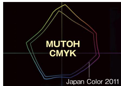
MUTOH CMYK enlarges color gamut. * "Japan color" complies with the ISO.